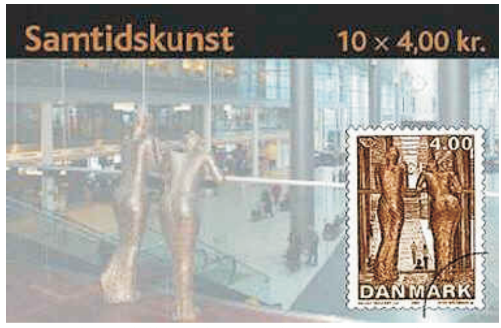
"Pigerne I Lufthavnen" – booklet cover. The stamps are sold as singles, and the 4.00 Dkr-stamp also in a booklet pane of 10 stamps. The 4.00 Dkr stamp is for a 20g-letter domestic rate, and the 5.00 Dkr-stamp is for a 20g-letter to Europe, including the (Danish) Faeroe Islands and Greenland.