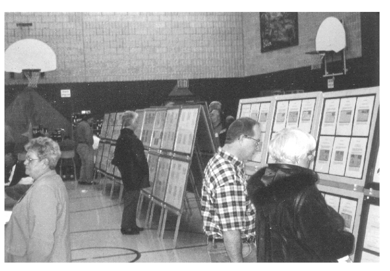
View of the Oxford Stamp Club Exhibition – There was a total of 68 six page frames at the show.